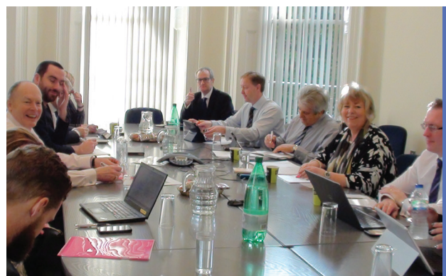
The FODO Board gathering for a meeting

That is precisely what we at FODO do as well. My fellow directors, officers and myself, plus the exceptional FODO staff team, are delighted to be here for you and the wider sector. I thank you all wholeheartedly for your continuing support.