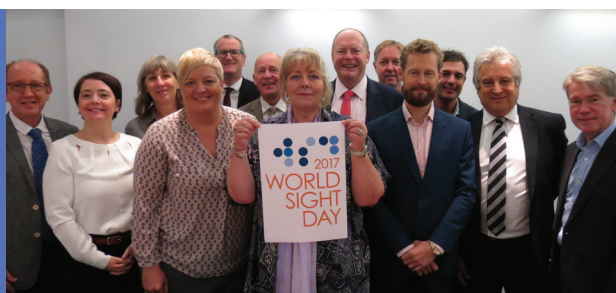
FODO Board marking World Sight Day 2017

As well as actively supporting National Eye Health Week in the UK, FODO joined hundreds of organisations across the globe on World Sight Day on 12 October 2017 in calling for cuts to avoidable blindness. The 2017 'Make Vision Count' campaign drew attention to findings that increases in myopia and diabetic retinopathy, combined with a growing and ageing global population, could potentially lead to a tripling of blindness worldwide by 2050.